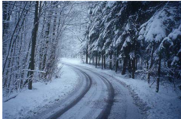
ARE YOU BRAVE ENOUGH TO RIDE IN JANUARY?