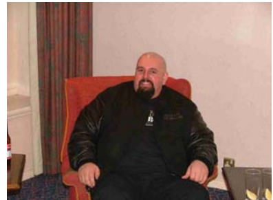
Aire Valley members turned out in force for the 2006 Xmas and New Year party