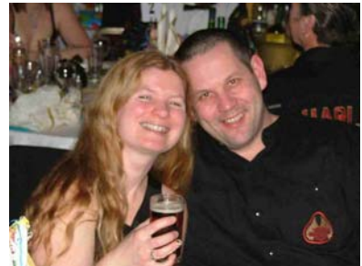
Good food - Good company - Great venue