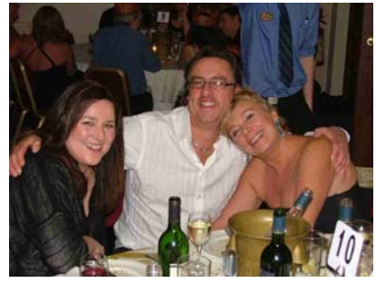
A full gallery of pictures is available on the website - www.avhog.co.uk