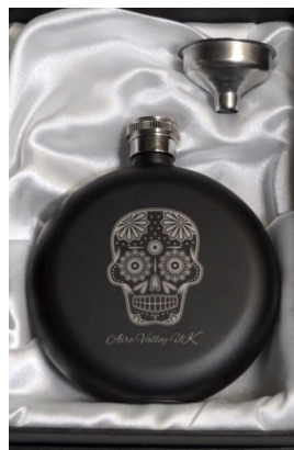
Aire Valley Hip Flask

We are running an incentive this year to encourage everyone to join in the official chapter ride outs. This will entail a point system for each ride out that you participate in and the top 6 will get a Aire Valley UK hip flask.